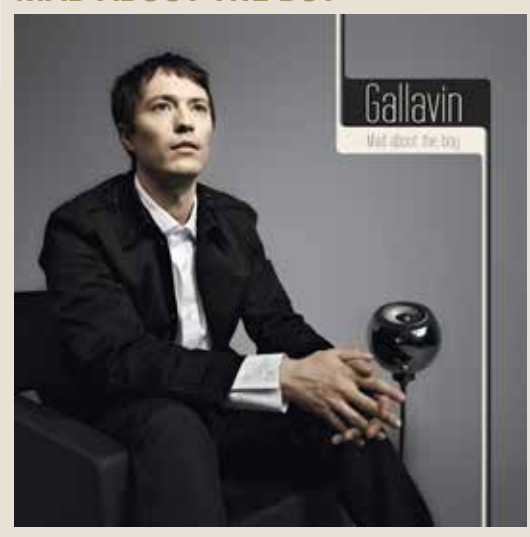
1<sup>st</sup> Album - Edited in January 2010 Production: Gallavin