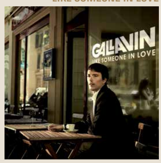
3<sup>rd</sup> single - Edited in October 2012 Production: Gallavin