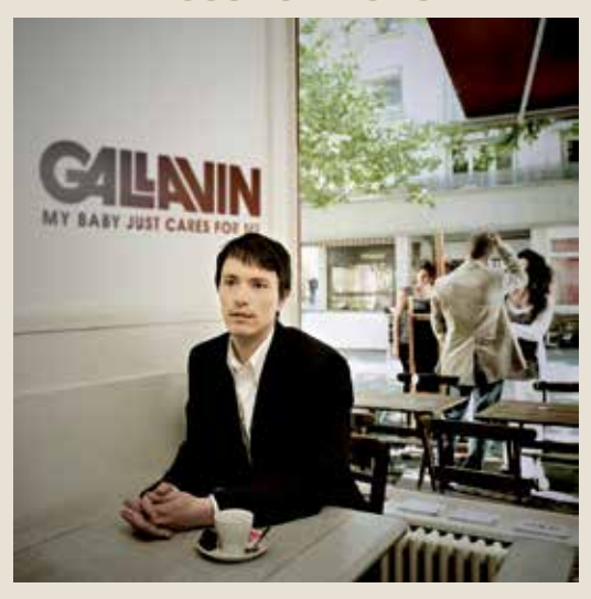
2<sup>nd</sup> single - Edited in January 2012 Production: Gallavin